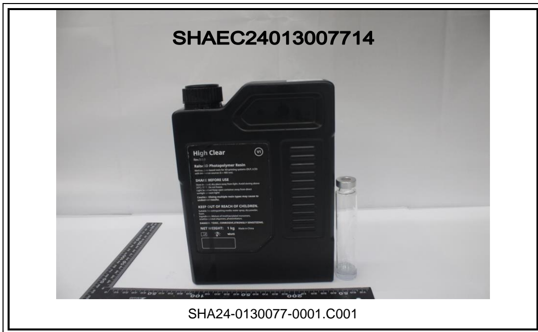
此照片仅限于随 SGS 正本报告使用 ***报告结束***